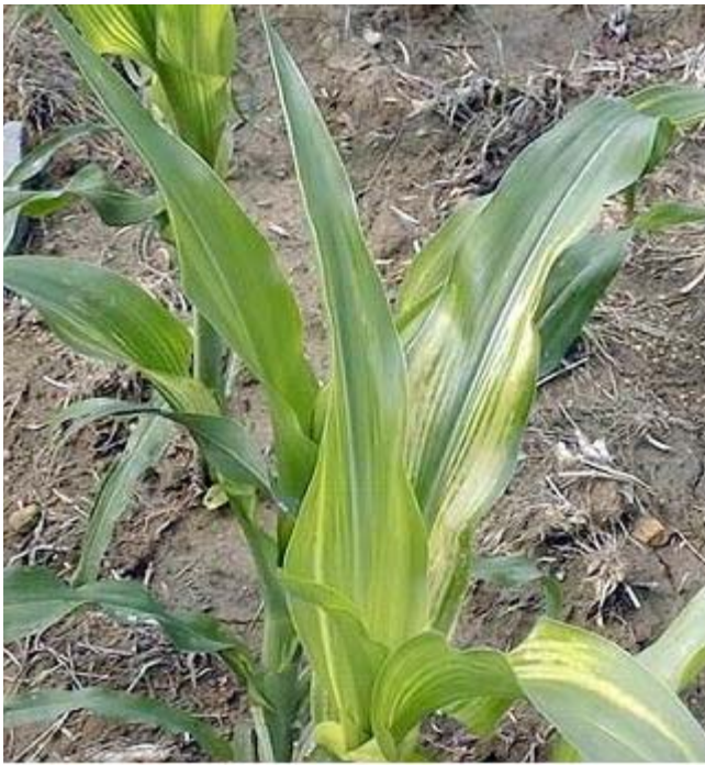
Figure 2. Zinc deficiency in corn showing interveinal chlorosis, bleaching and shortening of internodes resulting in stunted compact growth.

gest that Zn nutrition should be of concern for golf course superintendents. There are, however, very few scientific reports of turfgrass response to fertilizer Zn additions (13) and little to no information on the identification and correction of Zn deficiencies can be found in the widely cited turfgrass management publications (8, 9, 10). This lack of published proof of a benefit of fertilizer Zn on turf production, however, should not be interpreted as proof that there is no need for fertilizer zinc (7).