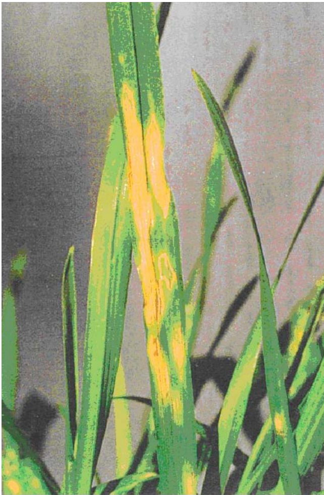
Figure 4. Zinc deficiency in wheat showing characteristic necrosis and chlorosis.

ment and Zn contamination while simultaneously allowing for a determination of the degree to which the applied product is absorbed by the leaf surface, transported within the plant, and utilized for metabolic activities.