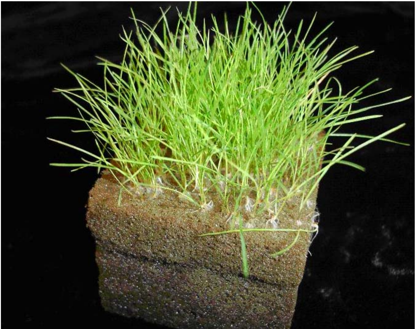
Figure 5. Model growth system designed for testing of foliar fertilizer and non-fertilizer products. System allows for repeated cutting and resampling of each 1.5 x 1.5-inch experimental unit.

spreader. The soil surface was protected from direct contamination with plastic and lanolin barriers. Independent tests using the tracer ion, rubidium, confirmed that no foliar spray materials entered the soil.