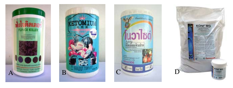
Fig. 3. Some of mycofungicides; (A) Fungi Killer, (B) Ketomium, (C) NovacideE, and (D) KONI<sup>®</sup> WG.