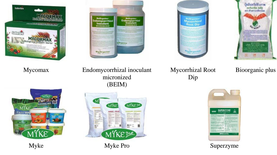
Fig. 4. Some of fungal biofertilizers available in the market.

be resistance for biotic and abiotic stresses, 3) be fast growing and 4) have high productivity. The large scale inoculum production cost should be low. A future prospect in fungal biocontrol agents may be obtained by using transgenic fungi (Marin, 2006).