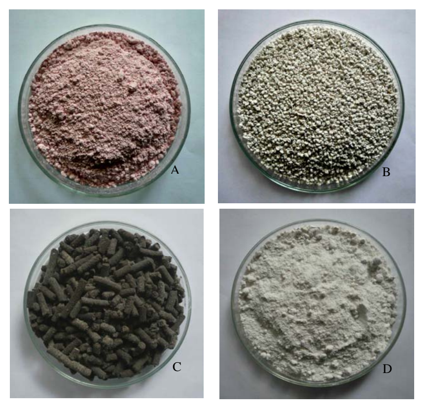
Fig. 2 Some formulation types of mycofungicides. A Ketocin<sup>®</sup> in powder formulation, B Ketomium<sup>®</sup>in pellet formulation, C Fungi Killer<sup>®</sup> in pellet formulation and D Novacide<sup>®</sup> in powder formulation.

impressive growth of contaminants (Hynes and Boyetchko, 2005; Spadaro and Gullino, 2005). Presently, there are many mycofungicides worldwide in the market as show in Table 1 and Figs 2 and 3.